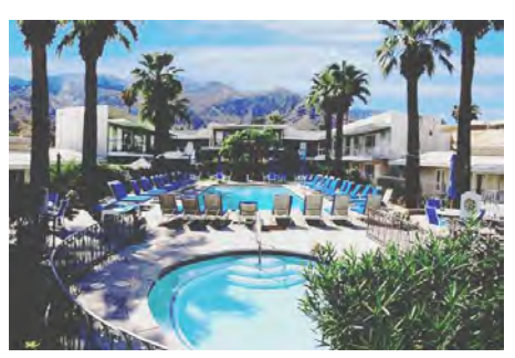
Canyon Club Hotel - Inside View

Please RSVP no later than Tuesday, March 24.