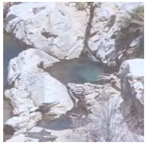
Deep Creek Hot Springs Pool

Camping near the springs is not permitted, and so not suggested for this trip.