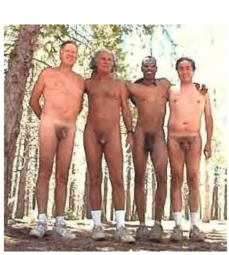
A few of our guys on our July 10, 2004 hike.

If you're interested, please contact us online if you can, but via any method on the last page of this newsletter is fine, too.