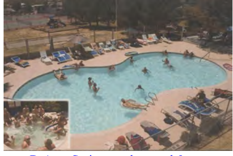
DeAnza Springs outdoor pool & spa

Sunday, June 7, 4pm-9pm <u>Imperial Spa</u> See 5/9 for details.