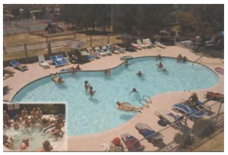
DeAnza Springs outdoor pool & spa

Imagine that this wonderful place allows nudity everywhere, including in their nice café, where you can order 3 meals a day from around $5 to $12, as well as in their bar (open in the