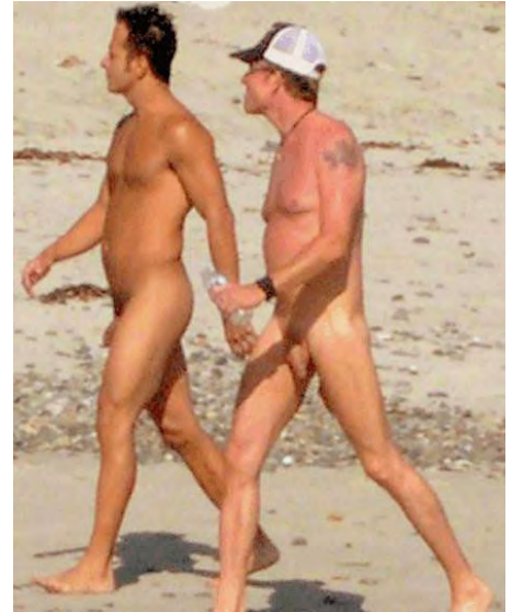
Beach walk for 2 at San Onofre.

If you're interested in grabbing a late bite after the spa, there's a Del Taco & Taco Bell/Pizza Hut Express nearby that are both open late - mention which you'd prefer, if interested, in comments when you RSVP.