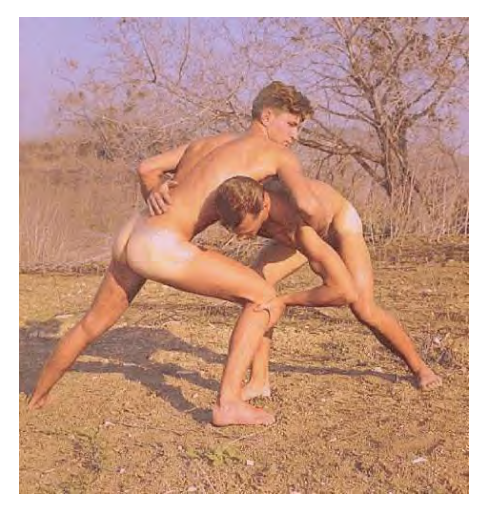
Sunday, February 17, 5pm-10pm "A Return to Innocence": An "initialization into communal nudity" with Massage Exchange & Jacuzzi Soak

To RSVP for this event, please email: BCMEN1+RSVP+0208@GMail.com