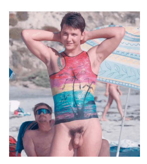
We Need Official Members!

not publish your name or numbers to the general public unless you ask us to. Only members and/or those attending your event will get your information, if that is your wish.