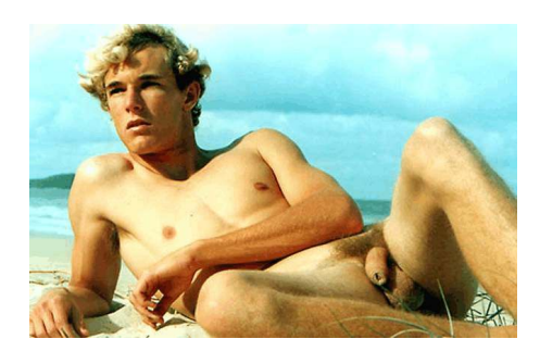
Let's Go Outside!

Back to the topic... As soon as we get an offer to host an event from someone we can schedule our next event!