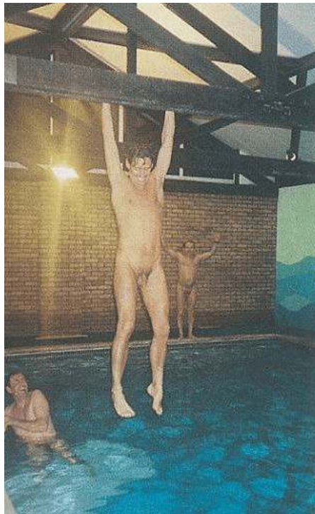
(Above photo is one of the pools at Tecopa Hot Springs in Tecopa, CA.)

If you wish like to feature an item for sale, a room for rent, your services to offer, etc, please get in touch with us via: e-mail at LBAND@ALTERN.org ; by phone or FAX to either (310) 884-1019 or (888) 487-9025, x1002; or by mail to the address on the last page. ▼