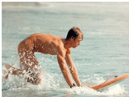
(Above photo taken at Black's Beach, San Diego, CA.)

Contact us TODAY to get your event scheduled! ▼