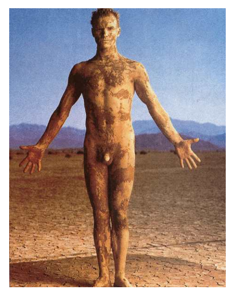
A hint: He's a singer.

The answer to who is shown here will be in the next issue.